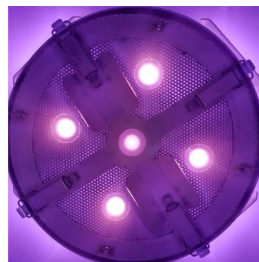
Rotating drum option