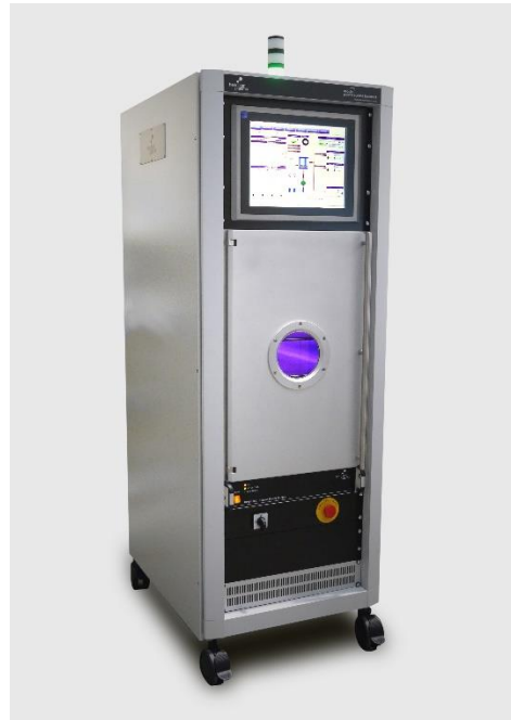
Nebula advanced plasma system

Henniker's plasma processes solve problems in a wide range of industries where high performance material properties are required, including aerospace, automotive and medical device manufacture.