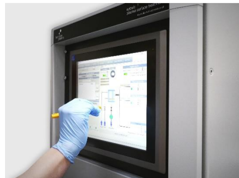
Portals software application

Henniker Plasma www.plasmatreatment.co.uk info@plasmatreatment.co.uk Tel: +44 (0)1925 830771